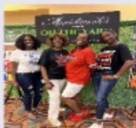
Admit One Hospitality