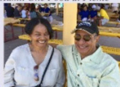
Admit One Food at Picnic

Member ticket $100.00 if you are a member of one of the NCM Chapters. Non-member tickets are $155.00 . Individuals are urged to contact the nearest chapter to purchase a ticket, or you may call 202-689-5774 for ticket information.